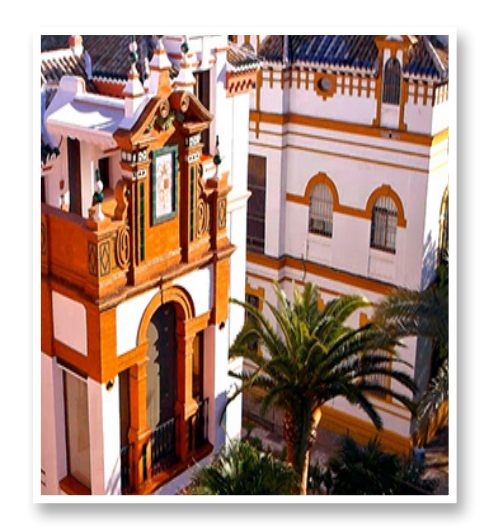
Vibrant architecture adorns the streets in this Spanish city.

The Sevilla program is offered during the fall or spring semesters for an affordable price. Included with each semester's cost, students will receive housing, health insurance, tuition and fees and an excursion that connects the courses to a hands-on exploration of the Spanish culture.