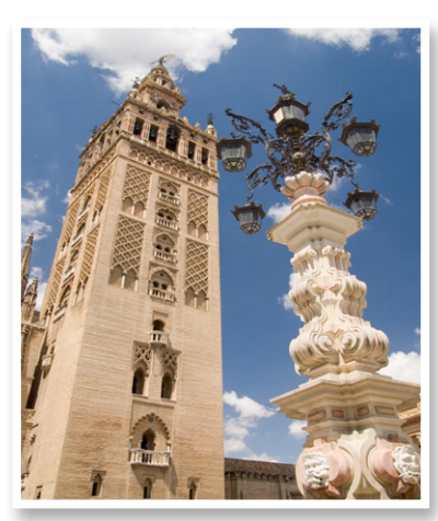
The Giralda, one of Sevilla's icons.

If you want to be fully immersed in Spanish culture, take advantage of the homestay option. You'll receive three meals a day and laundry service once a week. Alternatively, if a dorm-style living arrangement with other international students sounds more appealing, you can choose a residencia or a fully-furnished apartment.