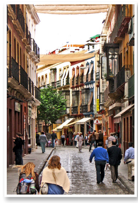
A colorful street in downtown Sevilla.

Interested in spending a semester in Sevilla? The deadline to apply for the 2018 spring semester is September 15, 2017.